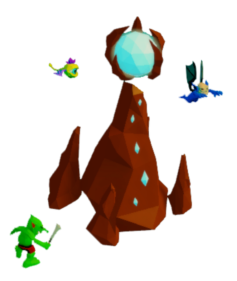
Will the mage be able to defeat the Magic Forger and his devil creations?